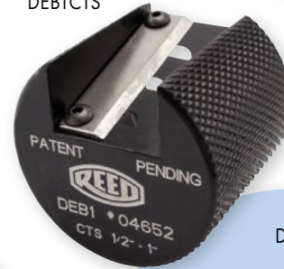
DEB1IPS-INT in use